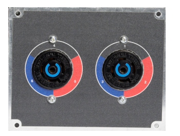
L21-20R*, L21-30R, L15-20R, L15-30R