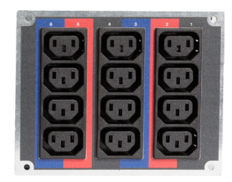
IEC320-C13 (208V)*, IEC320-C13 (230V)