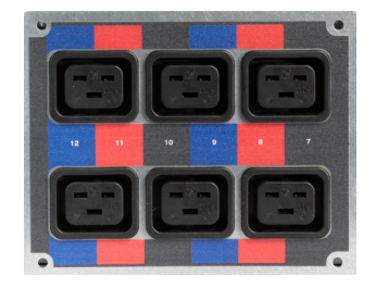
IEC320-C19 (208V)*, IEC320-C19 (230V)