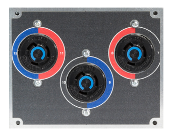
L6-15R, L6-20R*, L6-30R, L14-20R, L14-30R